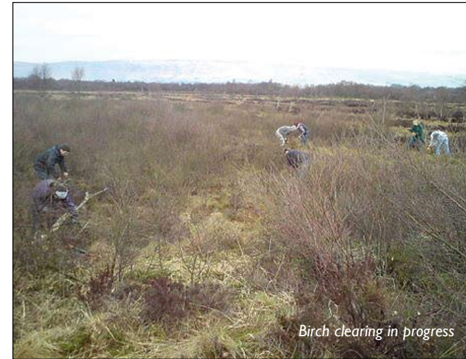
Birch clearing in progress

Chairman, Friends of Lenzie Moss. June 2010.